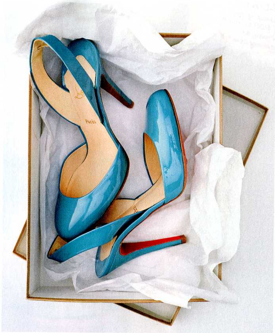
Readers' guiltiest pleasures revealed. 27